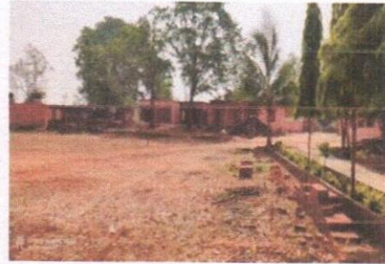
(school garden & playground)