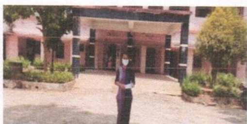
( School building)