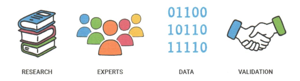
Fig. 1.3: Foundation of Learning Progression

"There is no single, universally accepted and absolutely correct learning progression." --- W. James Popham